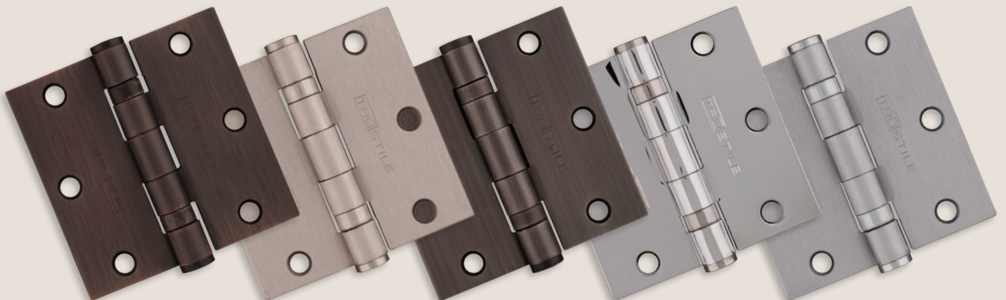
US10B Oil Rubbed Bronze